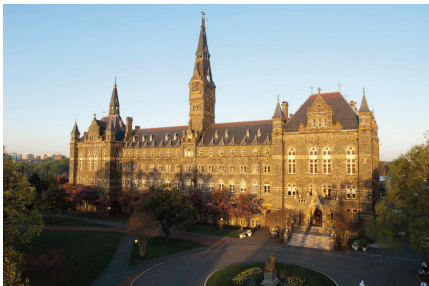
Healy Hall at Georgetown University.