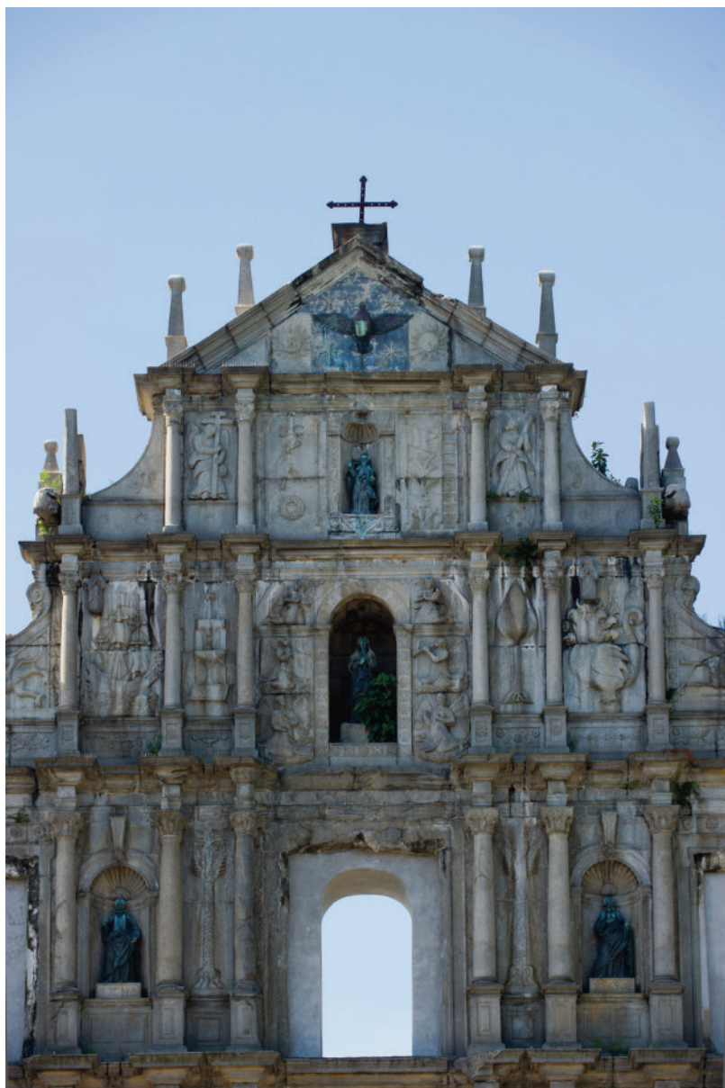
Facade of Saint Paul's church in Macau, which was the administrative center for Jesuit ministry in Southeast Asia. Today the facade is a UNESCO World Heritage Site.