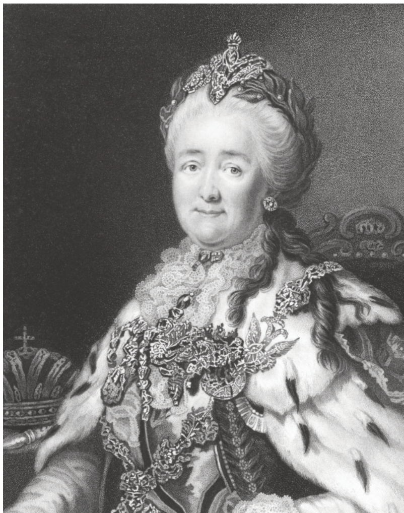
Catherine the Great refused to suppress the Jesuits and played a vital role in maintaining their training.