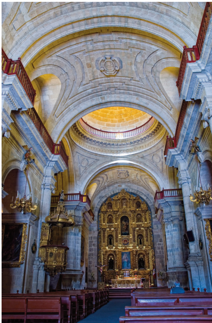
Interior of the Church of the Society of Jesus in Cusco, Peru.