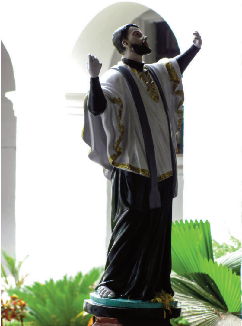
Statue of Saint Francis Xavier in Goa, India.