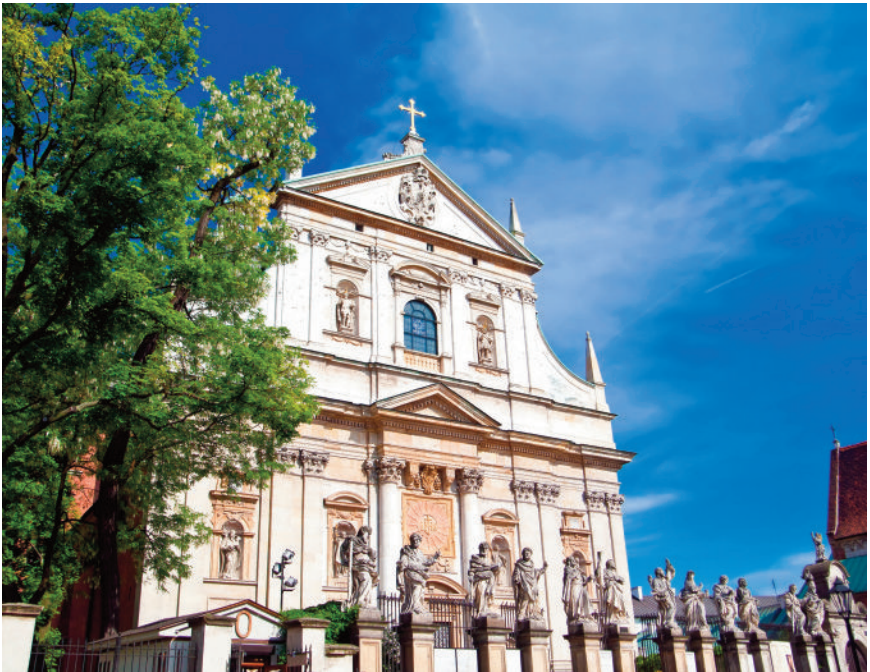
Detail of the collegiate church of Saints Peter and Paul in Krakow. The facade is one of the most dramatic examples of the international influence of the Jesuits' mother church, the Gesù in Rome.