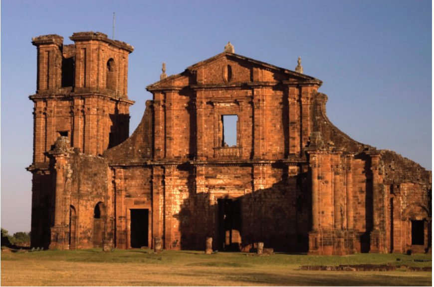
São Miguel das Missões was one of the many Jesuit reductions in South America. It is now a UNESCO World Heritage Site.