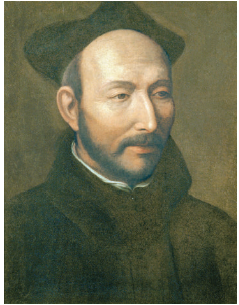
Posthumous portrait of Ignatius of Loyola by Jacopino del Conte, 1556.