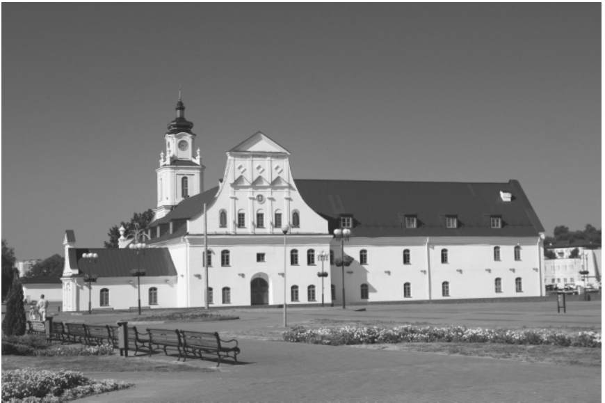
Jesuit college at Orsha (Orsza), Belarus