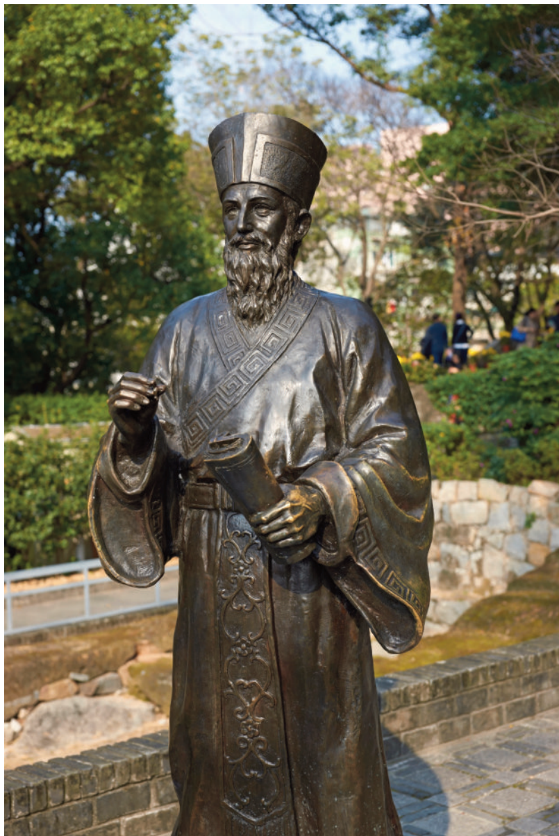
Statue of Matteo Ricci at Saint Paul's church in Macau, where Ricci studied Chinese.